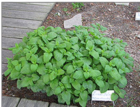
Lemon Balm