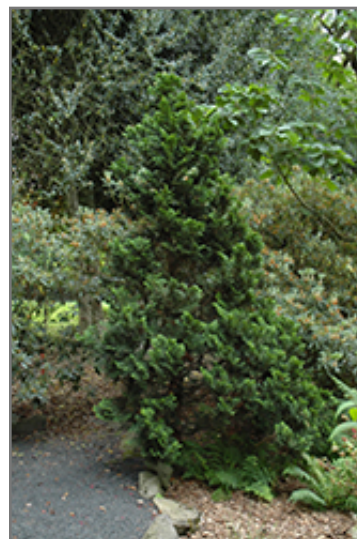
Nana Dwarf Hinoki Falsecypress