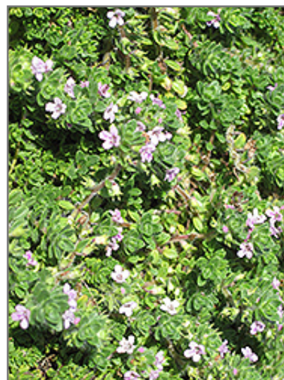
Pink Chintz Creeping Thyme flowers