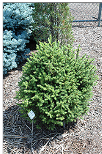
Sherwood Compact Norway Spruce