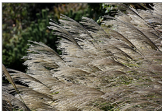
Gracillimus Maiden Grass fruit