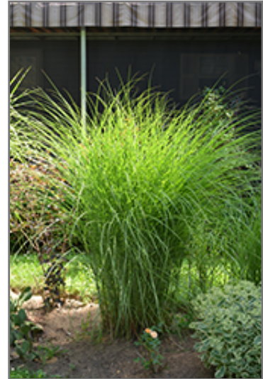
Gracillimus Maiden Grass

This plant does best in full sun to partial shade. It prefers to grow in average to moist conditions, and shouldn't be allowed to dry out. It is not particular as to soil type or pH. It is highly tolerant of urban pollution and will even thrive in inner city environments. This is a selected variety of a species not originally from North America. It can be propagated by division; however, as a cultivated variety, be aware that it may be subject to certain restrictions or prohibitions on propagation.