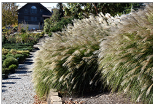
Gracillimus Maiden Grass

Gracillimus Maiden Grass is recommended for the following landscape applications;