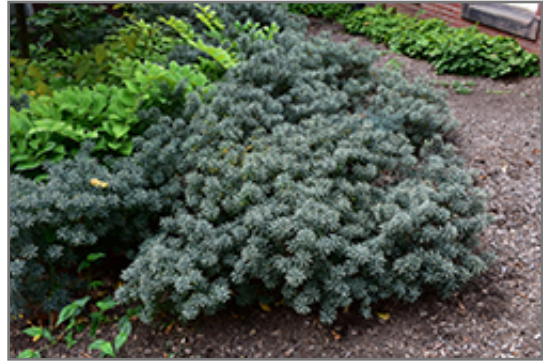
Carol Mackie Daphne

This shrub does best in full sun to partial shade. It prefers dry to average moisture levels with very well-drained soil, and will often die in standing water. It is not particular as to soil pH, but grows best in clay soils. It is somewhat tolerant of urban pollution, and will benefit from being planted in a relatively sheltered location. Consider applying a thick mulch around the root zone in winter to protect it in exposed locations or colder microclimates. This particular variety is an interspecific hybrid, and parts of it are known to be toxic to humans and animals, so care should be exercised in planting it around children and pets.