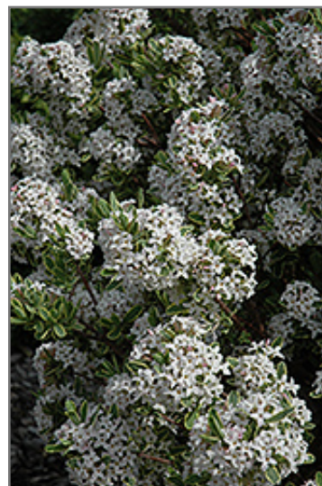
Carol Mackie Daphne flowers