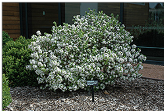
Carol Mackie Daphne in bloom