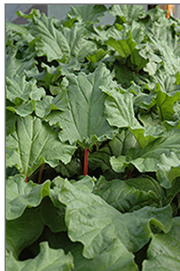
Canada Red Rhubarb

Aside from its primary use as an edible, Canada Red Rhubarb is suitable for the following landscape applications;