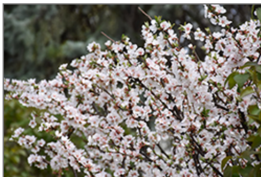
Nanking Cherry flowers

Nanking Cherry is covered in stunning fragrant shell pink flowers along the branches in early spring, which emerge from distinctive pink flower buds before the leaves. It has forest green deciduous foliage. The fuzzy pointy leaves turn yellow in fall. The fruits are showy cherry red drupes carried in abundance from early to mid summer.