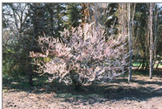
Nanking Cherry in bloom