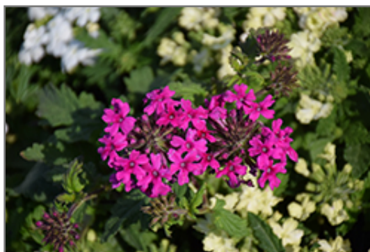
Homestead Hot Pink Verbena flowers