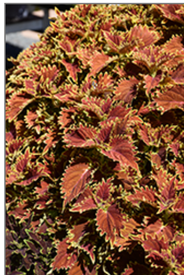
Copperhead Coleus foliage