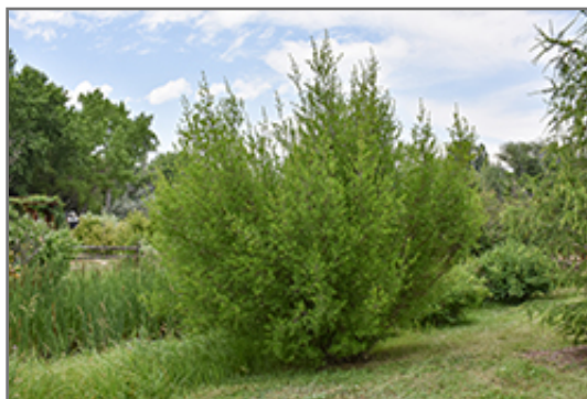
New Mexico Privet

New Mexico Privet is recommended for the following landscape applications;