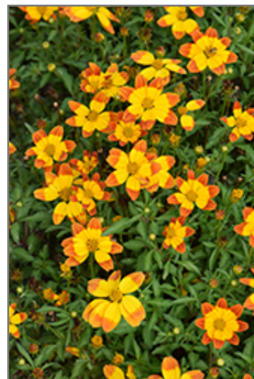
Bidy Boom Red Bidens flowers