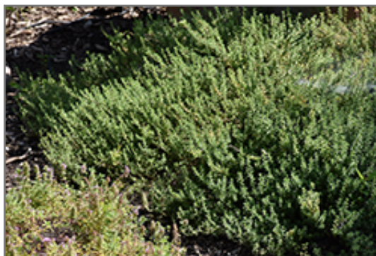
Common Thyme

This plant is quite ornamental as well as edible, and is as much at home in a landscape or flower garden as it is in a designated herb garden. It should only be grown in full sunlight. It prefers to grow in average to dry locations, and dislikes excessive moisture. It is considered to be drought-tolerant, and thus makes an ideal choice for a low-water garden or xeriscape application. It is not particular as to soil type or pH. It is highly tolerant of urban pollution and will even thrive in inner city environments. Consider covering it with a thick layer of mulch in winter to protect it in exposed locations or colder microclimates. This species is not originally from North America. It can be propagated by division.