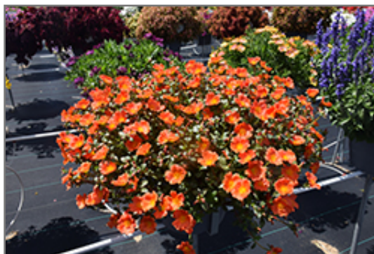
Mega Pazzaz Orange Portulaca in bloom