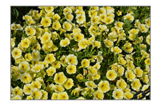
Bee's Knees Petunia flowers