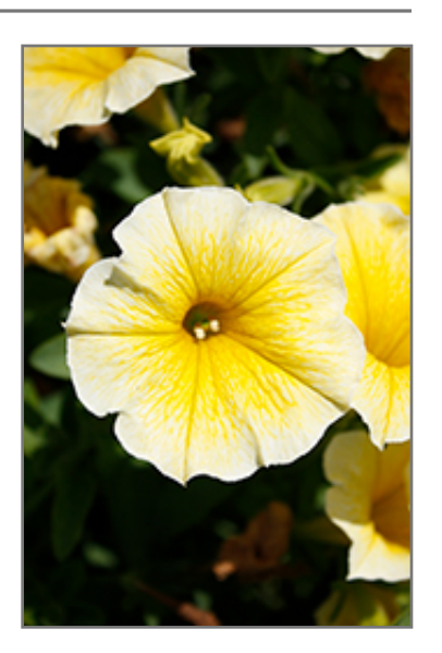
Bee's Knees Petunia flowers