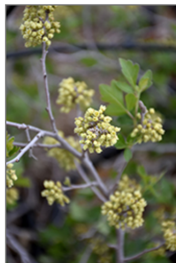
Autumn Amber Creeping Sumac flowers