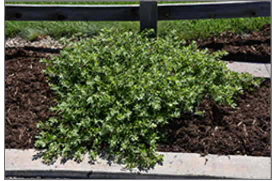
Autumn Amber Creeping Sumac

Autumn Amber Creeping Sumac will grow to be about 14 inches tall at maturity, with a spread of 8 feet. It tends to fill out right to the ground and therefore doesn't necessarily require facer plants in front. It grows at a medium rate, and under ideal conditions can be expected to live for approximately 30 years.