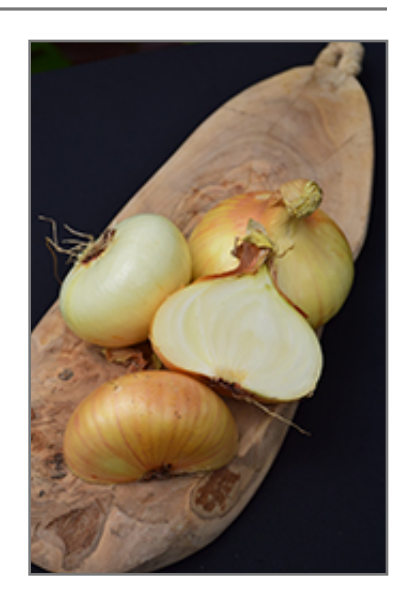
Vidalia Onion fruit and flesh

This plant is typically grown in a designated vegetable garden. It should only be grown in full sunlight. It does best in average to evenly moist conditions, but will not tolerate standing water. It is not particular as to soil type or pH. It is highly tolerant of urban pollution and will even thrive in inner city environments. This is a selected variety of a species not originally from North America. It can be propagated by multiplication of the underground bulbs; however, as a cultivated variety, be aware that it may be subject to certain restrictions or prohibitions on propagation.