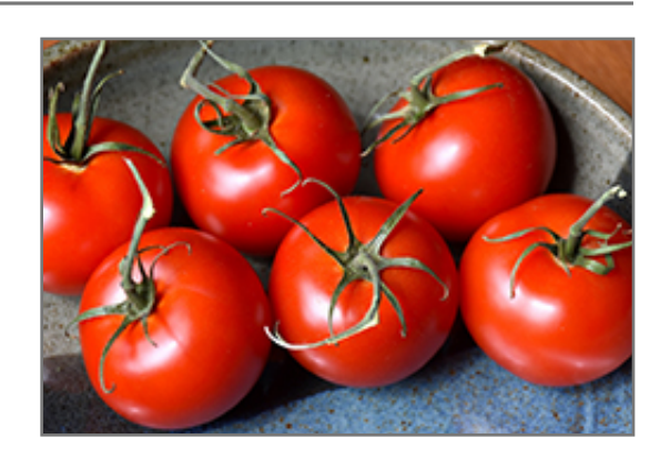
Patio Tomato fruit

This plant can be difficult to integrate into a landscape or flower garden, and is best grown in a designated vegetable garden. It should only be grown in full sunlight. It does best in average to evenly moist conditions, but will not tolerate standing water. It is not particular as to soil pH, but grows best in rich soils. It is somewhat tolerant of urban pollution. Consider applying a thick mulch around the root zone over the growing season to conserve soil moisture. This is a selected variety of a species not originally from North America.