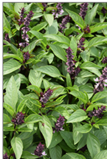
Sweet Basil flowers

Sweet Basil is a good choice for the edible garden, but it is also well-suited for use in outdoor pots and containers. It is often used as a 'filler' in the 'spiller-thriller-filler' container combination, providing the canvas against which the larger thriller plants stand out. Note that when growing plants in outdoor containers and baskets, they may require more frequent waterings than they would in the yard or garden.