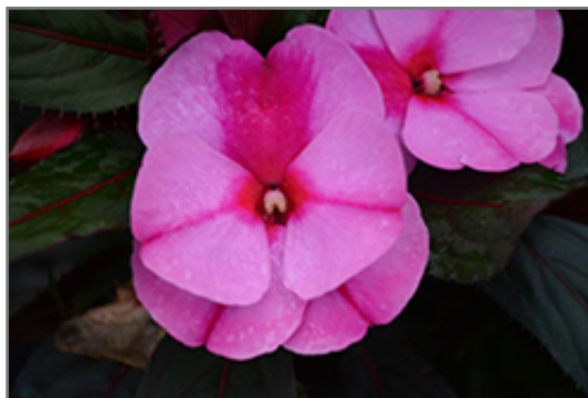
Magnum Lavender Splash New Guinea Impatiens flowers

Magnum Lavender Splash New Guinea Impatiens is recommended for the following landscape applications;