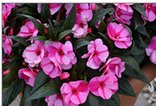
Magnum Lavender Splash New Guinea Impatiens flowers