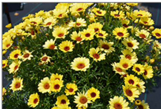
Grandaisy Yellow Daisy in bloom

Grandaisy Yellow Daisy is a fine choice for the garden, but it is also a good selection for planting in outdoor containers and hanging baskets. With its upright habit of growth, it is best suited for use as a 'thriller' in the 'spiller-thriller-filler' container combination; plant it near the center of the pot, surrounded by smaller plants and those that spill over the edges. Note that when growing plants in outdoor containers and baskets, they may require more frequent waterings than they would in the yard or garden.