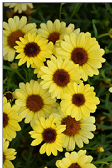
Grandaisy Yellow Daisy flowers

Grandaisy Yellow Daisy is recommended for the following landscape applications;