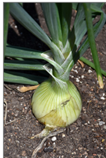
Walla Walla Onion fruit

Walla Walla Onion will grow to be about 18 inches tall at maturity, with a spread of 4 inches. When planted in rows, individual plants should be spaced approximately 6 inches apart. This vegetable plant is an annual, which means that it will grow for one season in your garden and then die after producing a crop. As this plant tends to go dormant in summer, it is best interplanted with late-season bloomers to hide the dying foliage.