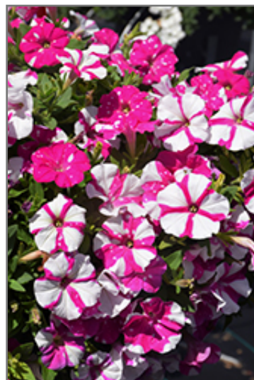
Headliner Pink Sky Petunia flowers