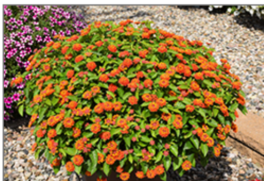
Hot Blooded Red Lantana in bloom