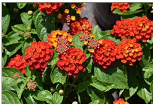
Hot Blooded Red Lantana flowers

Hot Blooded Red Lantana is recommended for the following landscape applications;