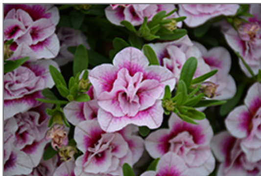
MiniFamous Uno Double PinkTastic Calibrachoa flowers

This plant will require occasional maintenance and upkeep. Trim off the flower heads after they fade and die to encourage more blooms late into the season. It is a good choice for attracting bees and butterflies to your yard, but is not particularly attractive to deer who tend to leave it alone in favor of tastier treats. It has no significant negative characteristics.