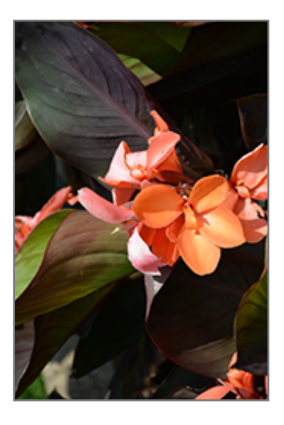
CannaSol Happy Wilma Canna flowers

This plant is native to the tropics and prefers growing in moist environments with evenly warm conditions all year round. In our climate, it is usually grown as an outdoor annual in the garden or in a container. If you want it to survive the winter, it can be brought in to the house and provided with special care, and then returned to the garden the following season. In its preferred tropical habitat, it can grow to be around 18 inches tall at maturity, with a spread of 14 inches. However, when grown as an annual or when overwintered indoors, it can be expected to perform differently, and its exact height and spread will depend on many factors; you may wish to consult with our experts as to how it might perform in your specific application and growing conditions.