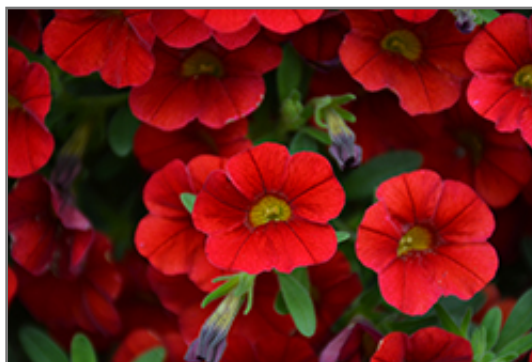
MiniFamous Neo Vampire Calibrachoa flowers

MiniFamous Neo Vampire Calibrachoa is recommended for the following landscape applications;