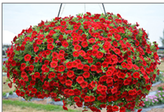
MiniFamous Neo Vampire Calibrachoa in bloom