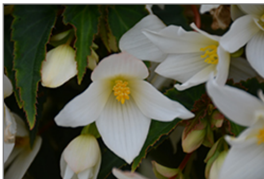
Beauvilia White Begonia flowers

Beauvilia White Begonia is recommended for the following landscape applications;