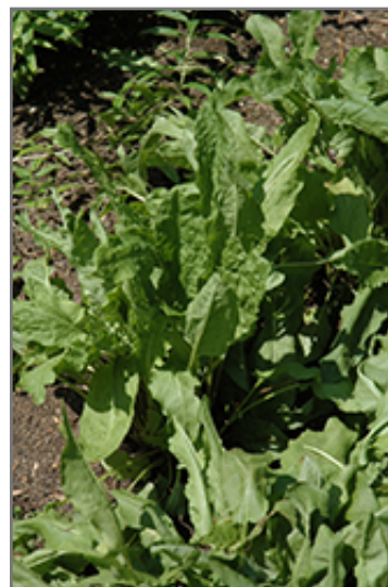
French Sorrel

Aside from its primary use as an edible, French Sorrel is suitable for the following landscape applications;