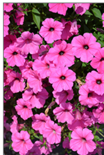
ColorRush Pink Petunia flowers