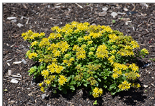
Little Miss Sunshine Stonecrop in bloom