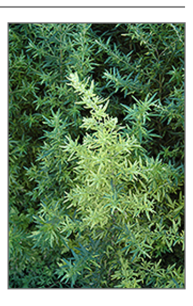
Oriental Limelight Artemisia foliage