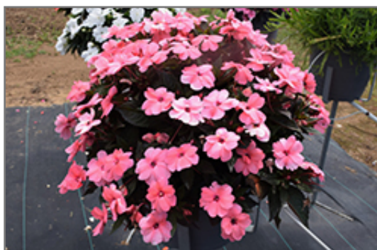
SunPatiens Compact Coral Pink New Guinea Impatiens in bloom