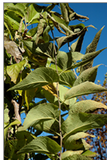
Prairie Sentinel Hackberry foliage