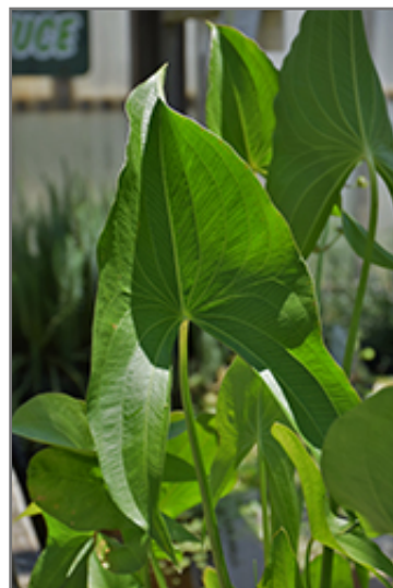
Broadleaf Arrowhead foliage

This native wetland plant features upright, arrowhead shaped green leaves; spreads by tuberous runners into a large colony; racemes of white flowers in summer; an excellent pond or container plant