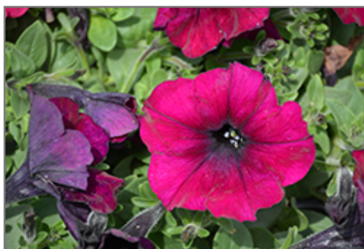
Easy Wave Burgundy Velour Petunia flowers