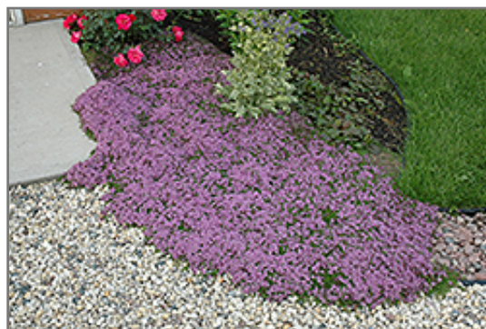
Red Creeping Thyme in bloom