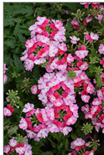
Lanai Twister Red Verbena flowers