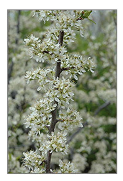
Santa Rosa Plum flowers