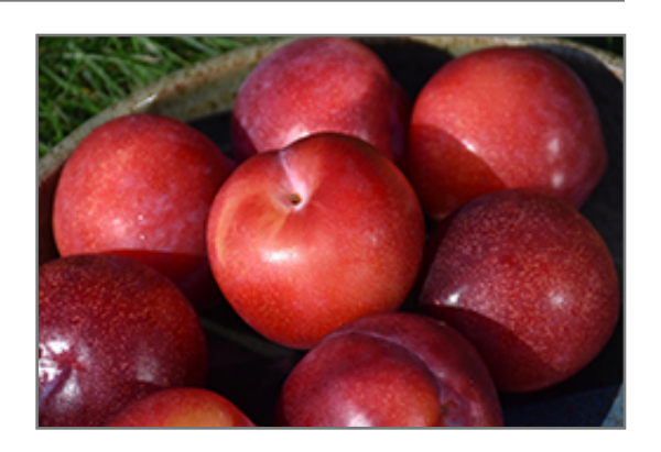
Santa Rosa Plum fruit

Santa Rosa Plum is smothered in stunning clusters of fragrant white flowers along the branches in early spring before the leaves. It has forest green deciduous foliage. The pointy leaves turn yellow in fall. The fruits are showy crimson drupes carried in abundance in late summer. The fruit can be messy if allowed to drop on the lawn or walkways, and may require occasional clean-up.