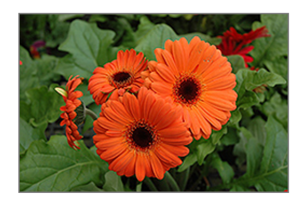
Orange Gerbera Daisy flowers