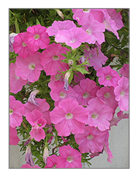
Wave Pink Petunia flowers