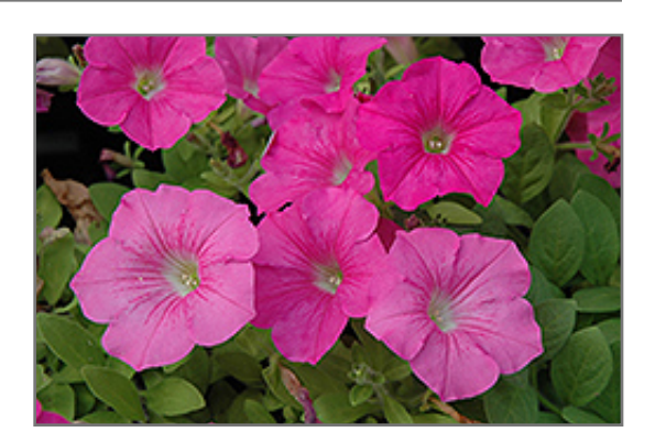
Wave Pink Petunia flowers