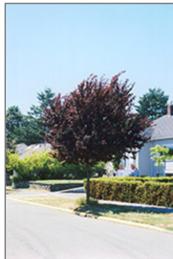
Newport Plum