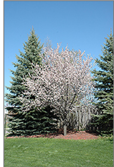
Newport Plum in bloom

This tree should only be grown in full sunlight. It does best in average to evenly moist conditions, but will not tolerate standing water. It is not particular as to soil type or pH. It is highly tolerant of urban pollution and will even thrive in inner city environments. This is a selected variety of a species not originally from North America.