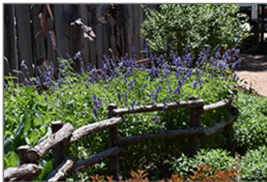
Mealy Cup Sage in bloom