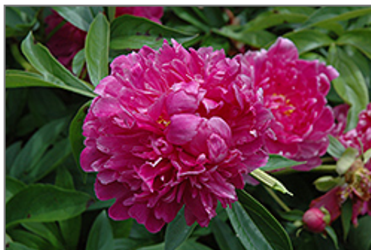
Victoire de la Marne Peony flowers