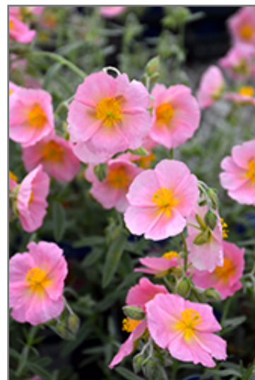
Wisley Pink Rock Rose flowers