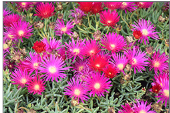
Purple Ice Plant flowers