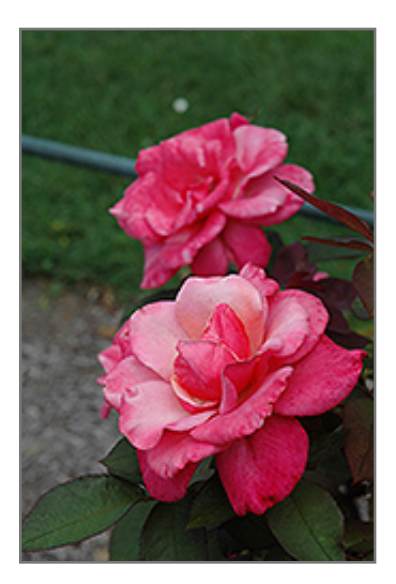
First Prize Rose flowers