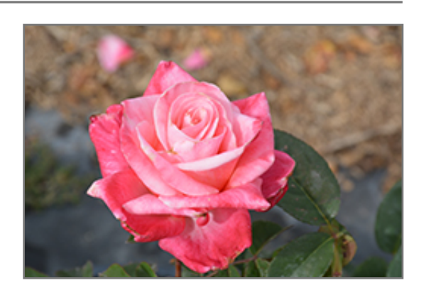
First Prize Rose flowers

First Prize Rose is recommended for the following landscape applications;