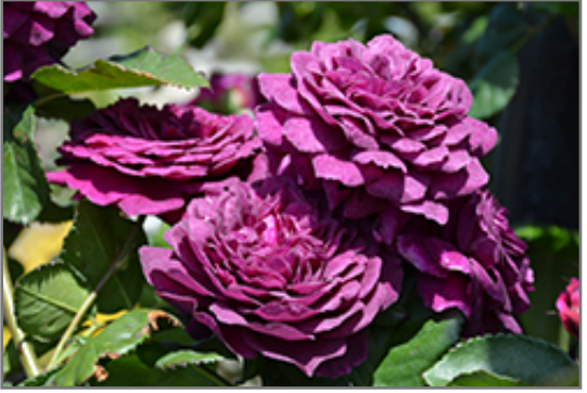
Ebb Tide Rose flowers