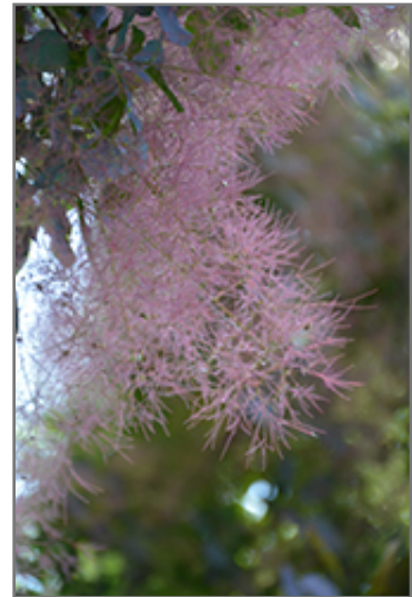
Royal Purple Smokebush flowers

This shrub should only be grown in full sunlight. It is very adaptable to both dry and moist locations, and should do just fine under average home landscape conditions. It is not particular as to soil type or pH. It is highly tolerant of urban pollution and will even thrive in inner city environments, and will benefit from being planted in a relatively sheltered location. This is a selected variety of a species not originally from North America.