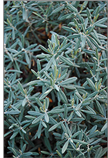
Blue Ice Bog Rosemary foliage

This shrub does best in full sun to partial shade. It prefers to grow in moist to wet soil, and will even tolerate some standing water. It is not particular as to soil type, but has a definite preference for acidic soils, and is subject to chlorosis (yellowing) of the foliage in alkaline soils. It is somewhat tolerant of urban pollution, and will benefit from being planted in a relatively sheltered location. Consider applying a thick mulch around the root zone in winter to protect it in exposed locations or colder microclimates. This is a selection of a native North American species.